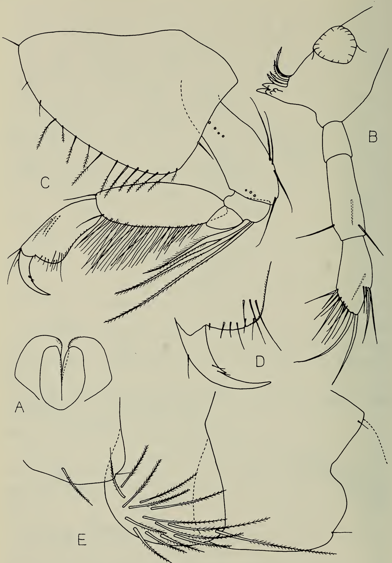
Fig. 3. Stenocorophium bowmani : A, Labium; B, Mandible; C-D, Gnathopod 1; E, Epi-meral plates 1-3.